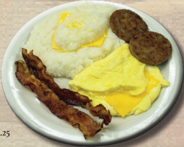
THE MACK ATTACK