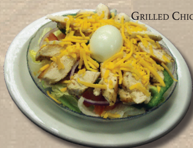
GRILLED CHICKEN CHEF

*CONSUMING RAW OR UNDERCOOKED MEATS OR EGGS MAY INCREASE YOUR RISK OF FOODBORNE ILLNESS.