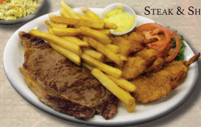
STEAK & SHRIMP