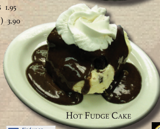
HOT FUDGE CAKE